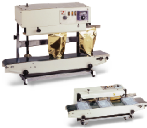
TABLE TOP BAND SEALER